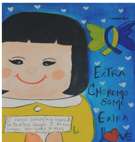
Vaibhavi More (3 rd sem BASLP)